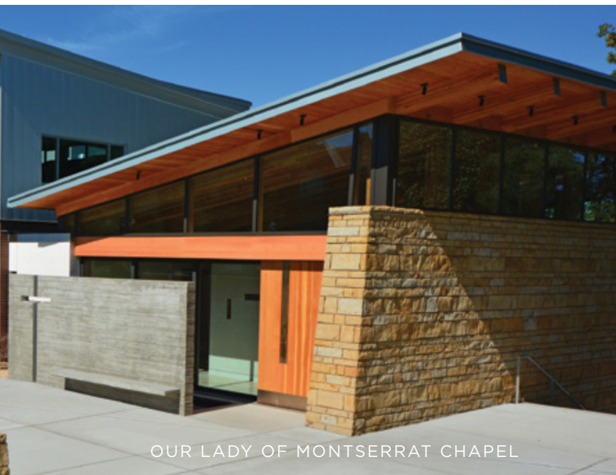
OUR LADY OF MONTSERRAT CHAPEL